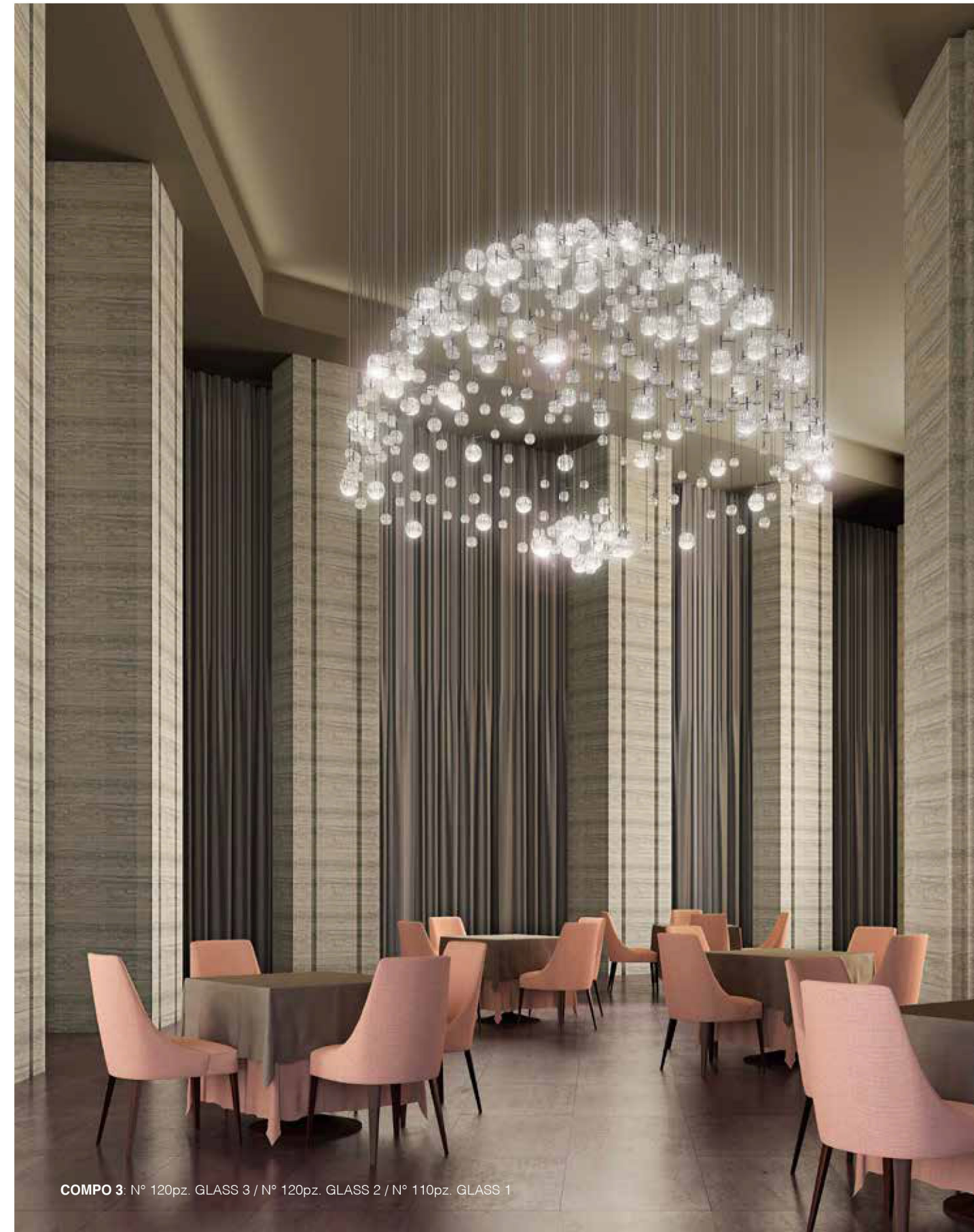
COMPO 3: N° 120pz. GLASS 3 / N° 120pz. GLASS 2 / N° 110pz. GLASS 1